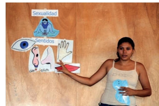
The «Colectivo de mujeres» in Nicaragua ran health education programmes aimed at empowering women until 2021. They are now unable to continue this work.

As people active within the Foundation, we are aware that standing up for human rights, peace and non-violence requires strength and, often, courage. Our partner organisations must summon even greater courage and moral courage; their lives are sometimes under threat. Supporting them is our task and our duty. To do this, we also need your support!