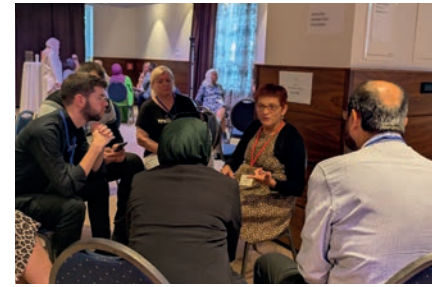
In a lot of workshops and discussion sessions, the conference participants discussed spirituality and non-violence.

In the deep conviction that we praise God by building peace. Conference participants, Omiš, 12 October 2025