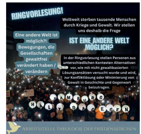
The Centre for Peace Churches Theology at the University of Hamburg conducts research into the Anabaptist and Mennonite traditions and promotes theology of peace and non-violence. It combines academic work with social engagement and international peace initiatives.

Today, Mennonites live on every continent in communities characterised by internal cohesion, solidarity and service to others. Their witness serves as a reminder that peace is possible – through dialogue, humility and persistent action.