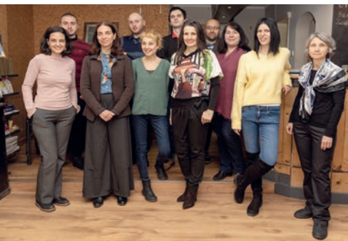
The dedicated team at the Centre for Legal Aid works to defend the rights of refugees in Bulgaria.

has been involved with the schwelle Foundation since 2009. Since retiring, the qualified engineer has also been active on the Board and in the finance and Southeast Europe working groups.