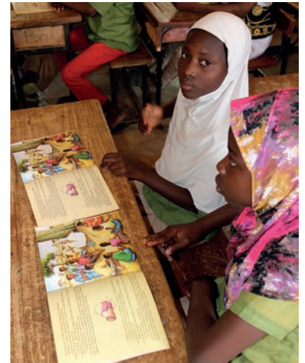
Reading in one's mother tongue is not a given in Niger.

I have the honour of presenting this Peace Award – to people who, through their lives, have found concrete answers to the world situation that are worthy of support. To that end, I would first like to thank the board and staff of the schwelle Foundation for their work on the Peace Award. They have selected initiatives that are exemplary. Undaunted and unwavering, the jury and donors find outstanding laureates. And you do this reliably, for the 12th time this year. It is often the small things, the initiatives and projects, that demonstrate a positive outlook on life and give us courage.