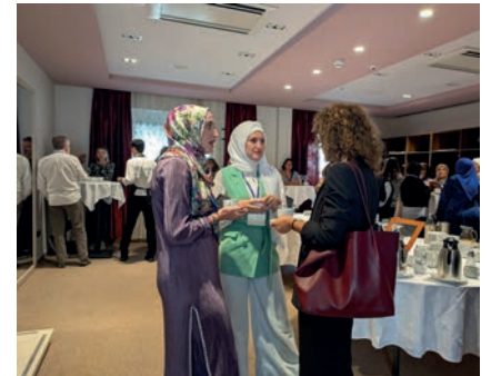
Encounters and in-depth discussions during the conference in Omiš.

RAND offers trainings in which participants learn to resolve conflicts non-violently and actively promote peace, and advocates for non-violent alternatives in politics and the church.