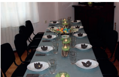
A festively laid Easter table:

is a political scientist and has been the managing director of the schwelle Foundation since 2008