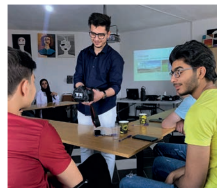
Film workshop at Peace of Art.